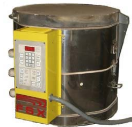
TrapBurner 7 1627