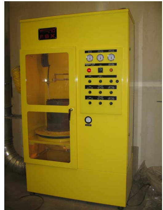
TrapBlaster 7 - 1627